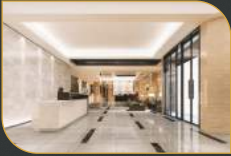
Entrance lobby with pop Decorative ceiling (separate entrance lobby and lift for commercial & residential)