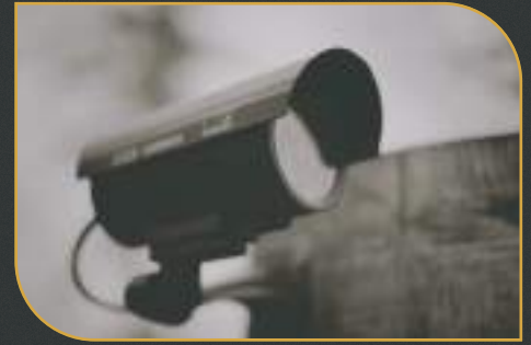
CCTV camera in lobby & surrounding