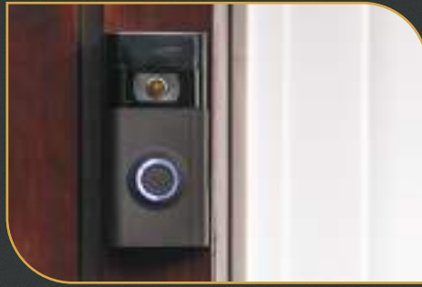
Intercom facility / video door camera