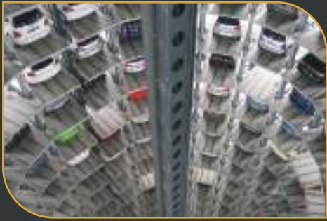
Hitech Car Parking (mechanical tower parking)