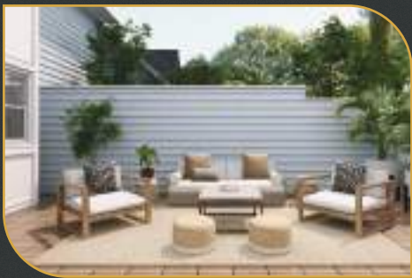
Homes with spacious Balcony