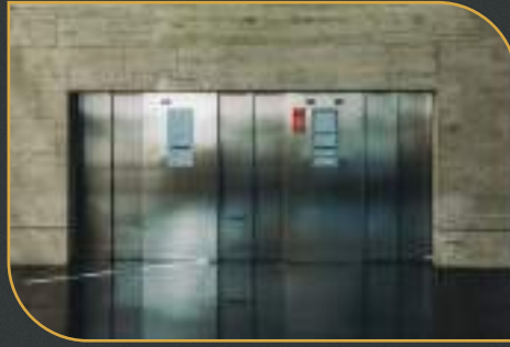
Hitech lift (separate entrance lobby and lift for commercial & residential)