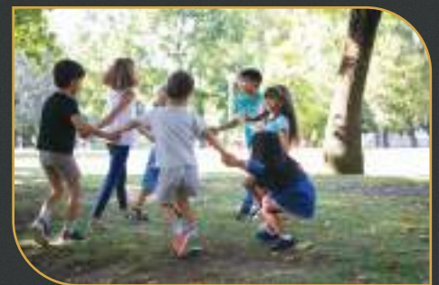
Podium Deck @5 th Floor Equipped With.