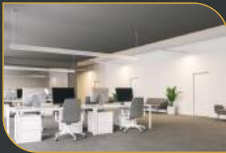
14ft Height For Commercial Units