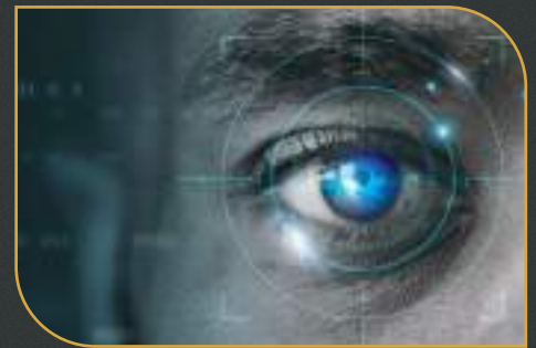
24 hour security