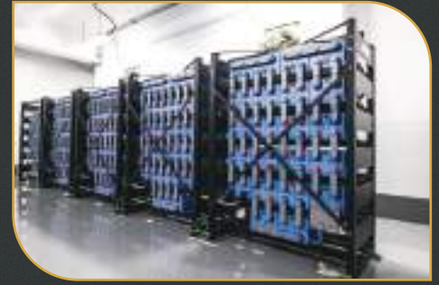
Power battery backup For lifts and staircase area